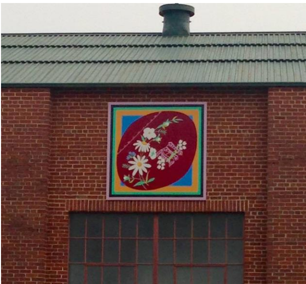
A beautiful quilt panel pops with color on the old Cotton Gin building in McCormick.

In order to make a quilt panel, one must bring in the original square or a picture of the square and a group of volunteers will design and create the quilt panel. Volunteers first prep the panel so the measurements are all exact and then they help choose the colors. The Red Rooster uses only the best quality paints available for these works of art. Once the paint is dry, the panel is primed with a high-quality, weather-resistant sealer that keeps the colors bright and the patterns distinct. Shaaron Kohl and her team work hard to make the colors vibrant and the size complimentary to the design. The bigger, the better! Prices for making a quilt panel depend of the desired size, ranging from 2' x 2' to 8' x 8'. Cost includes any and all materials needed to make the panel, even the volunteers! Anyone is welcome to the shop to come see this process of making a quilt panel.