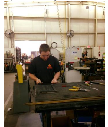
People work hard at Stoll Fireplace, whether they are cutting metal or exacting measurements.