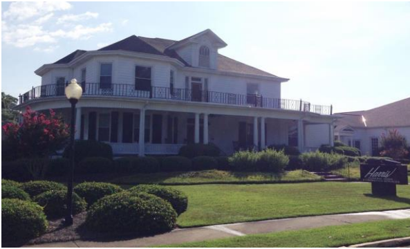
Harris Funeral Home is established in a building that was originally built in 1904.